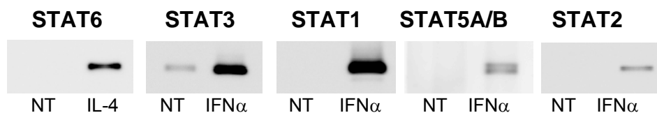
Figure 2. Immunoprecipitation/Western Blot analysis of multiplexed STAT analytes. 50 \mu g of lysates (nontreated, NT, or treated with 50 ng/mL IL-4 or 10,000U/mL IFN \alpha ) were mixed with capture antibodies to immunoprecipitate each respective protein. The immunoprecipitated proteins were separated on SDS-PAGE, transferred to nitrocellulose, and probed with biotin labeled phospho-specific detection antibodies. The proteins were imaged using Streptavidin-HRP and chemiluminescence.